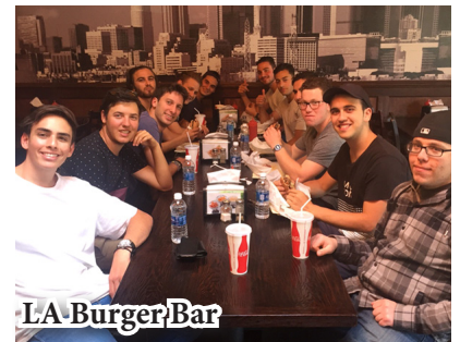
LA Burger Bar