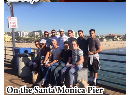
On the Santa Monica Pier