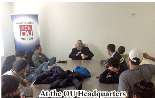
At the OU Headquarters

"I think that the program did a great job of presenting Judaism in an open and engaging manner. There was a strong sense of "if things don't make sense to you this way there may be other ways that they do"